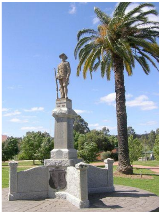
Jacka Park Soldiers Memorial