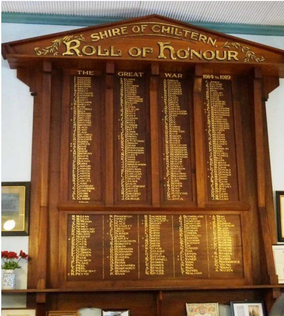
Shire of Chiltern Roll of Honour