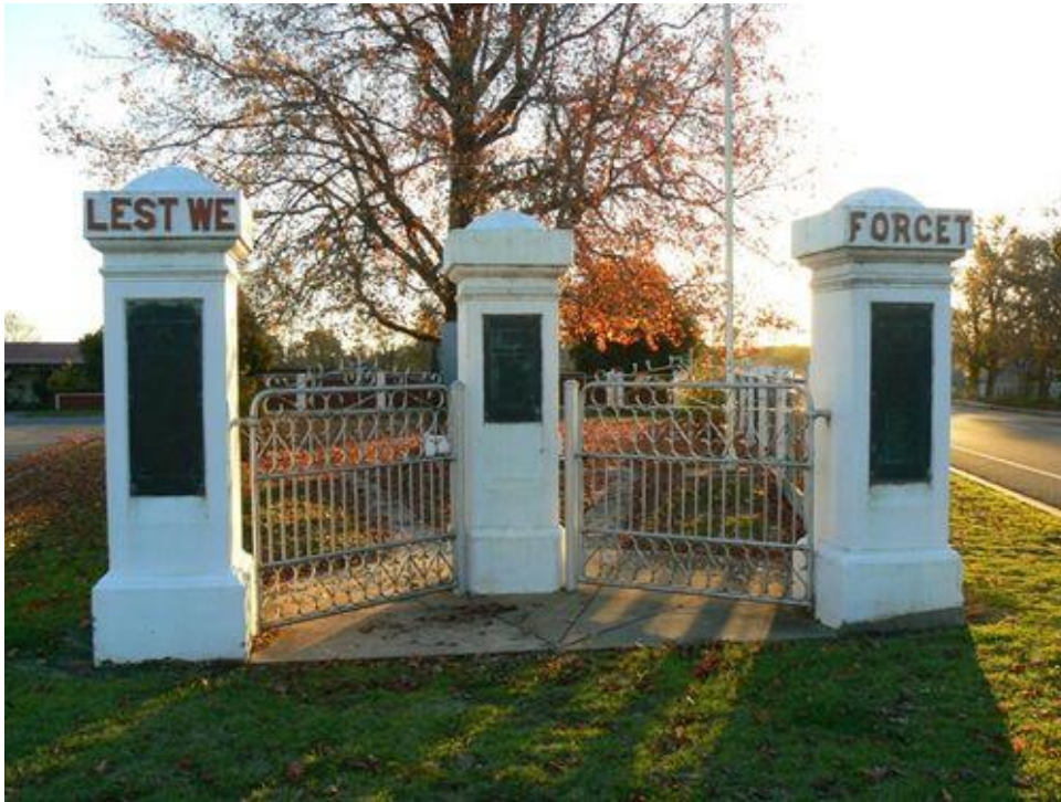
Chiltern Memorial Gates